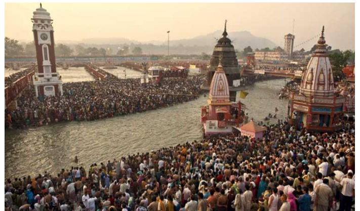
Kumbh Mela at Allahabad